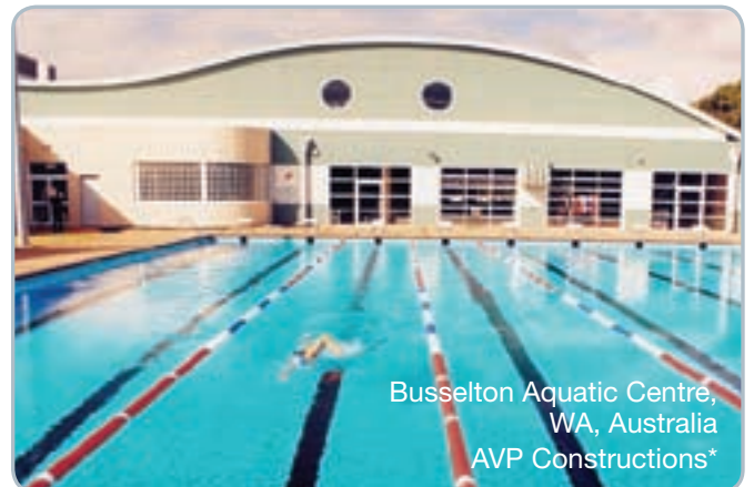
Busselton Aquatic Centre, WA, Australia AVP Constructions*