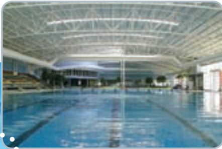
Bunbury Leisure Centre, WA, Australia AVP Constructions*

AquaForce forms the perfect leak-proof barrier between water and a variety of substrate materials such as concrete, stainless steel, timber and fibreglass. Due to its heavy gauge and surface bonding, AquaForce lays flat and resists wrinkling caused by expansion and contraction of the underlying substrate material and varying water temperatures.